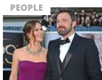
PEOPLE This is what Ben Affleck and Jennifer Garner said about their marriage - before they announced their divorce