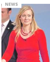
NEWS SexyMP: The most-viewed banned website in Parliament last year