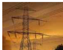
Cheaper energy on the way, but it's not all sunshine and rainbows