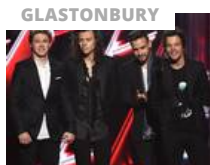
GLASTONBURY The real reason you won't see One Direction at Glastonbury

New Policy In UK: If You Don't Have Life Insurance, Read... Life Cover For Less Greek debt crisis