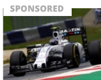
SPONSORED The art of the overtake and the counter strategy - by Bottas and Hulkenberg