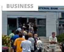
BUSINESS How Greece spent €250bn of borrowed money