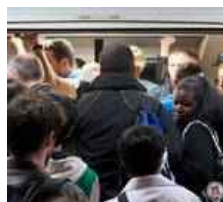
Just when you thought your commute couldn't get any worse...