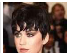
No grace of God for Katy Perry as sisters act to stop her buying convent