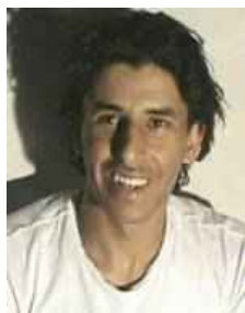
Making of a killer