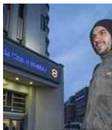
The Real Stories of Migrant Britain