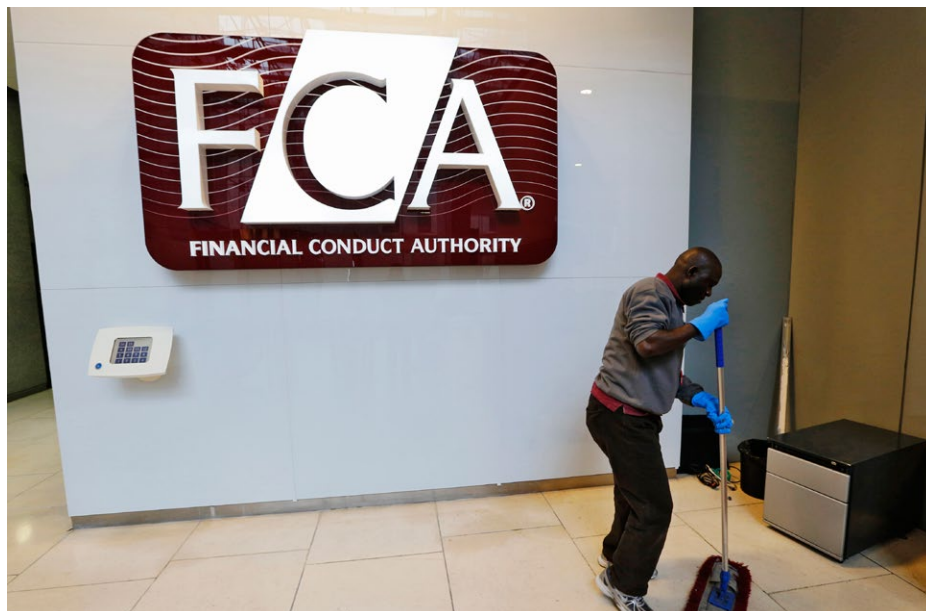
CLEAN UP: Britain’s Financial Conduct Authority began work in 2013 as part of an overhaul to the regulatory system following the financial crisis.

As the scheme stands now, the only chance