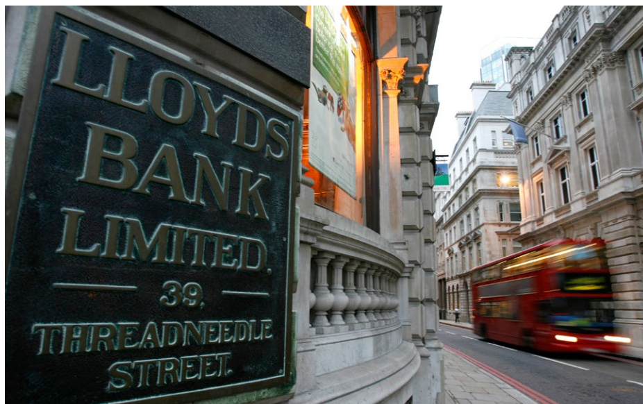
CITY: London's reputation as a financial centre has been hit by scandals that have cost Britain's four biggest banks more than 36 billion pounds in fines since 2009.