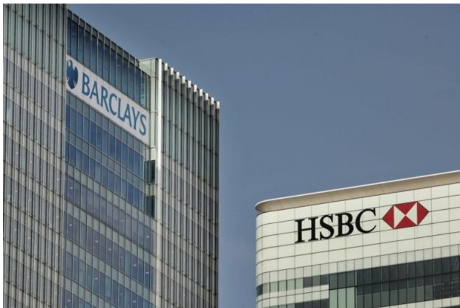
Barclays, HSBC and Royal Bank of Scotland were among those involved in the deals